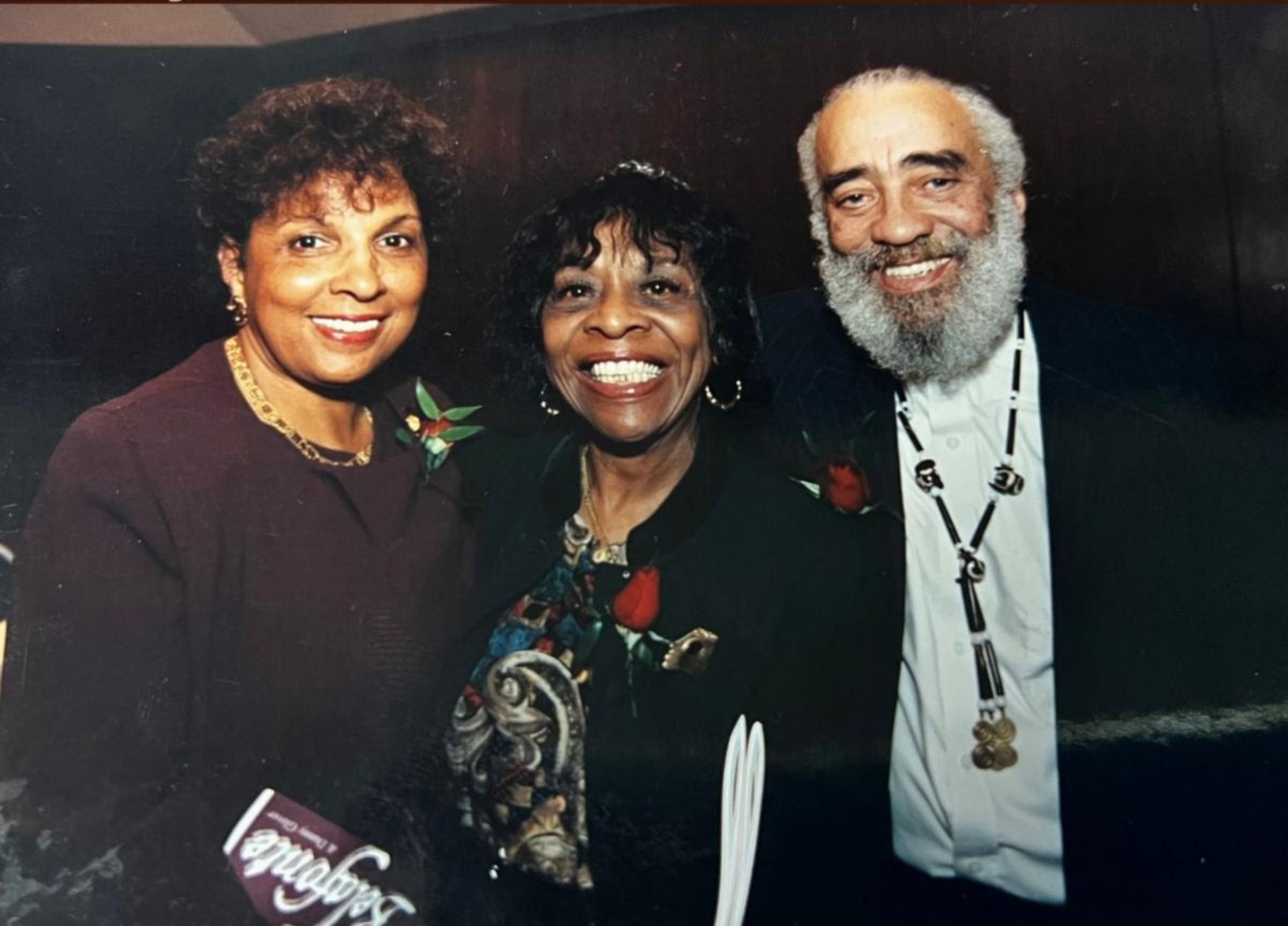
Oscar Brown Jr.